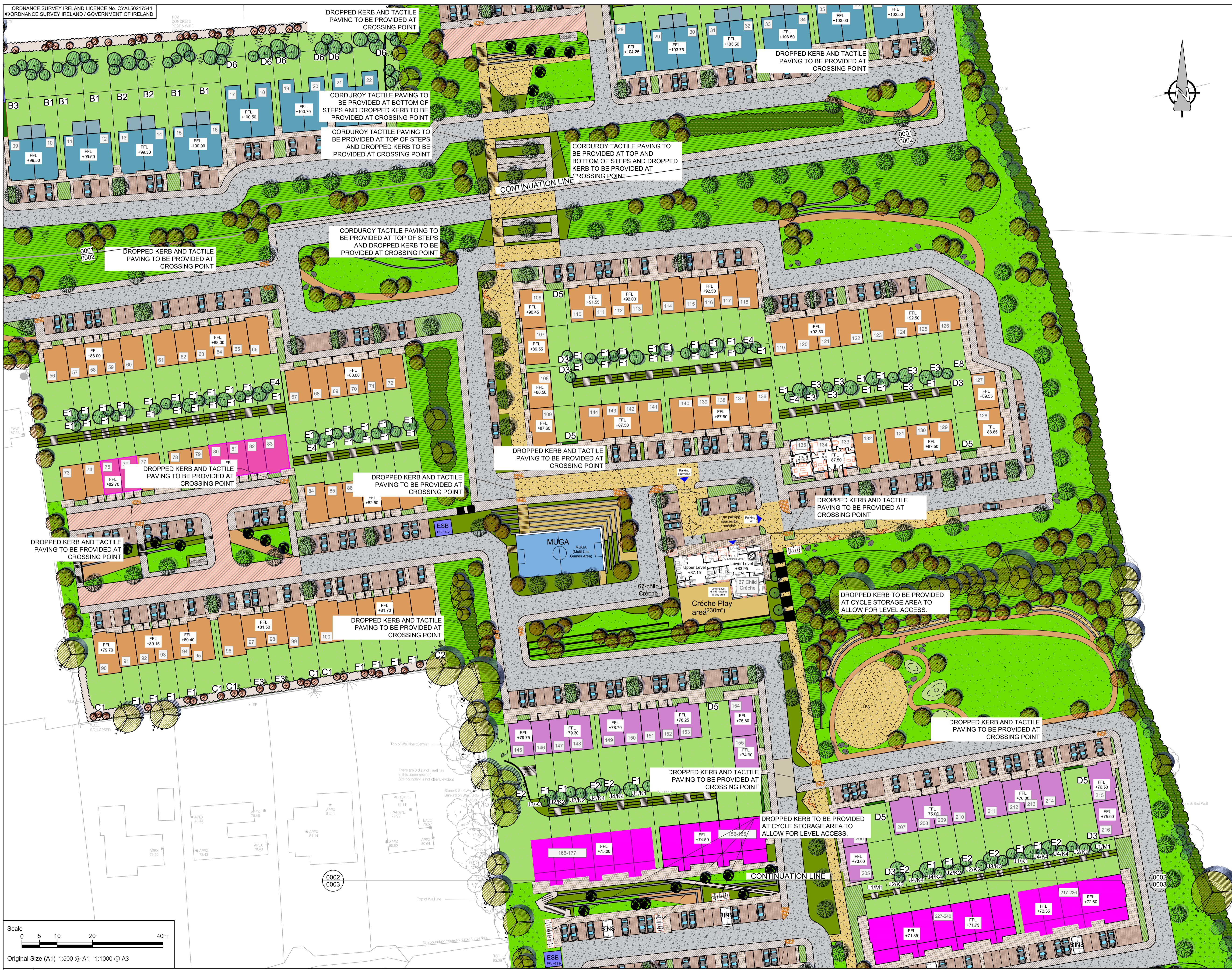
A PROPOSED GENERAL ARRANGEMENT 0002 Scale: 1:500

ISO A1 594mm x 841mm Approved: EMcK Checked: AP Designer: MC Project Management Initials: Last saved by: ALLEN PRENDERGAST (2021-11-25) Last Plotted: 2021-12-03 Filename: \\EU.AECOM\NET\COM\UK\BZ\JOBS\IPR-333915_GLOUNTHAUNE_PHASE_2\900_CAD_GIS\904_CEO1_WIP\02_SHEETS\0592432-ACM-00-00-DR-CE-10-0001.DWG